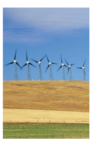
Wind power is a high-growth business that takes advantage of